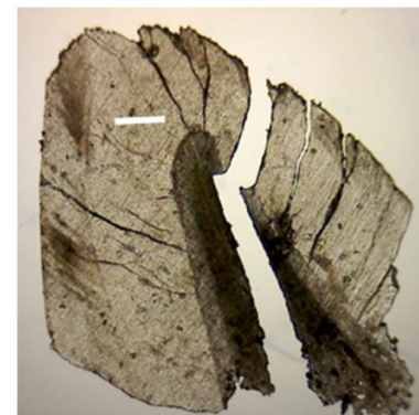
Figure 1: Tooth cusp of a mature tooth. Bright region: enamel. Dark region: dentine. Scale bar: 0.5 mm

The energy dispersive 2D detector (SLcam) was mounted on the diffractometer arm, so it could be rotated around the sample in order to cover a wider range of scattering angles. Due to an improved geometry involving a further reduced sample-detector position in the already very tight setup the measurements could be carried out with 2x2 detector positions as compared to 4x4 positions in the first experiment, which resulted in a great gain of speed. Together with the reduced exposure time of 60 s due to the strongly scattering sample, several texture maps of 800x800 \mu\text{m} and a number of line scans across the EDJ could be carried out.