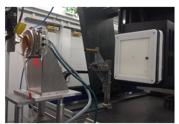
Fig. 1 – Linkam stage installed on ID15A

Unfortunately, when collecting data from the RSA samples during the first overnight run, the Laue signal showed significant streaking along particular directions. As would be expected, the extent of this streaking increased as the samples were heated, effectively obscuring the patterns and preventing