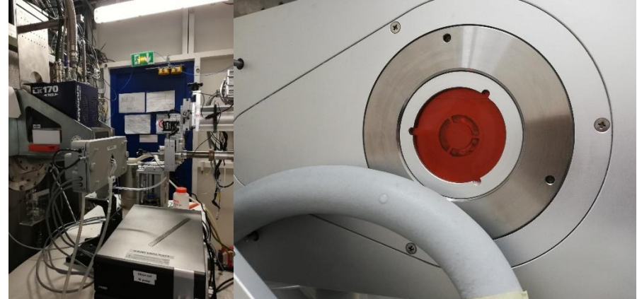
Figure 2: Left: experimental set-up of shear cell positioning in the beam. Right: design of shear cell propellor.

Samples were measured under shear, using a Linkam CSS450 equipped with nitrogen dewar for cooling (Figure 2 Left). Samples were loaded into the shear cell after which they were heated to 70°C. To make efficient use of time, the hutch was locked during this heating period of 10 min. Next, the samples were cooled at 20°C/min to 20 or 25°C and hold isothermally for 60 min. Shear was applied during the first 15 min of crystallization. The shear cell is designed with a 3-fold propeller (Figure 2 Right) that rotates when applying shear to the sample. When rotating, the three propeller ends block the beam for a short period of time. This is inherently related to the design of the shear cell. Measurements at the synchrotron facility are such short time frames that it was still possible to acquire data, which has proven unsuccessful on a lab-scale equipment. Both slow (1/s) and fast (50/s) shear rates were applied and both conditions have shown possible to obtain data. For statistics of the data, 10 short acquisitions were taken and then averaged. It will of course be necessary to check for every acquisition if it was blocked by the propellor, especially at the fast shear rate.