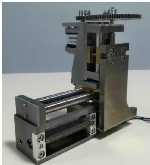
Fig. 1 Photo of Compact Transfocator

We assembled the setup for testing a new type of CRL-based Transfocator (Fig. 1) developed in the X-ray optics laboratory of the Immanuel Kant Baltic Federal University.