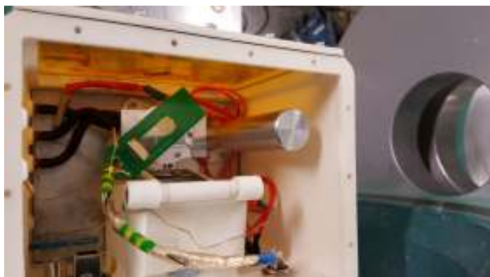
Figure 1: view of the NaT2 sample mounted on a PCB board inside the environmental chamber.

The OFETs layout consisted of a highly n-doped Si carrier substrate as a back gate electrode with a thermally grown 200 nm thick SiO 2 layer as the gate dielectric. On top, interdigitated source and drain electrodes were fabricated using electron beam evaporation of titanium and gold followeb by photolithography and lift-off processes. NaT2 layers were deposited by vacuum sublimation.