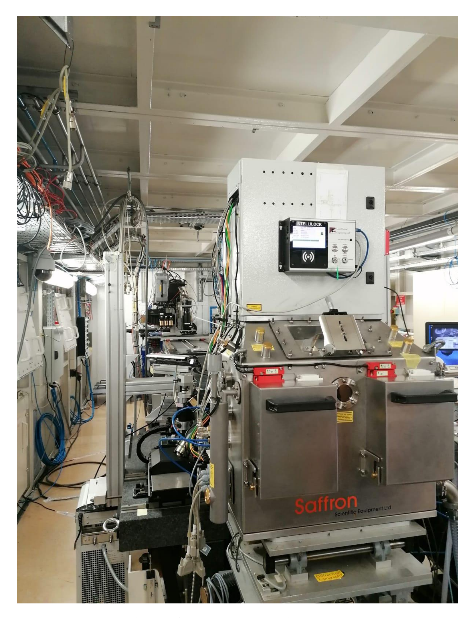
Figure 1. BAMPRII system mounted in ID19 hutch